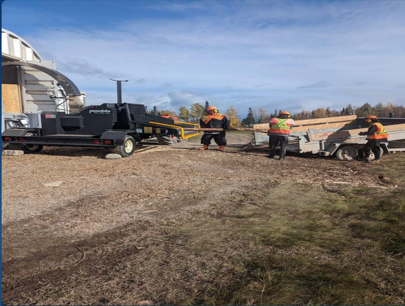
The Crew Feeding the Chipper 2023