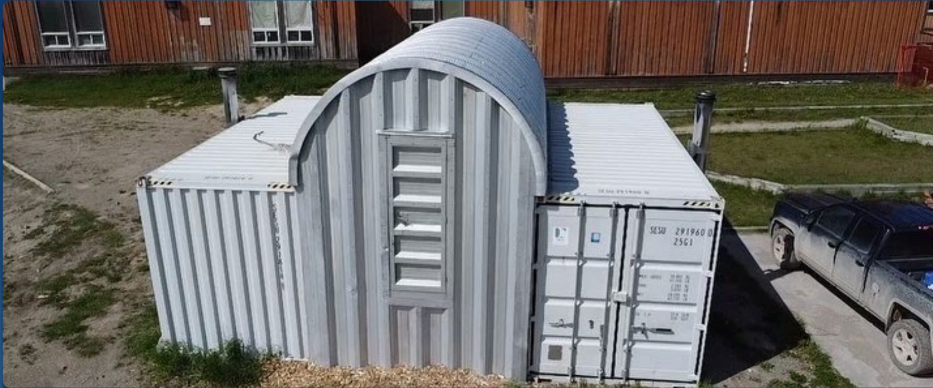
Drone view of Boilers/chip container.