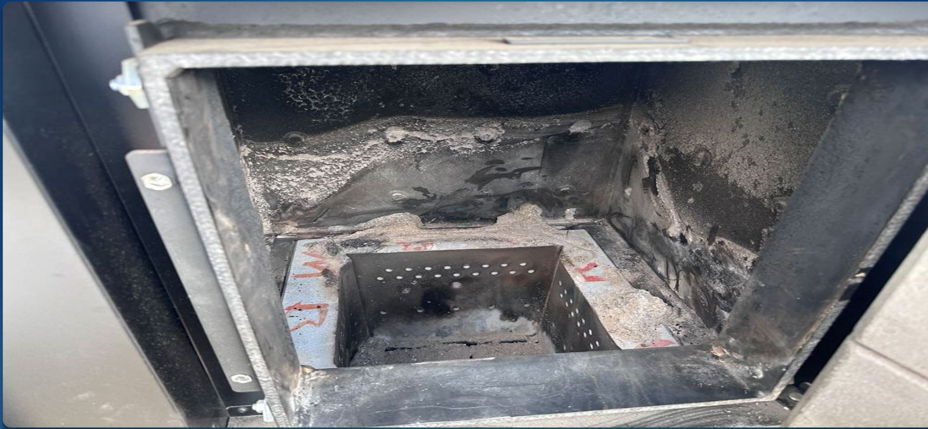
The inside of "Boiler2"