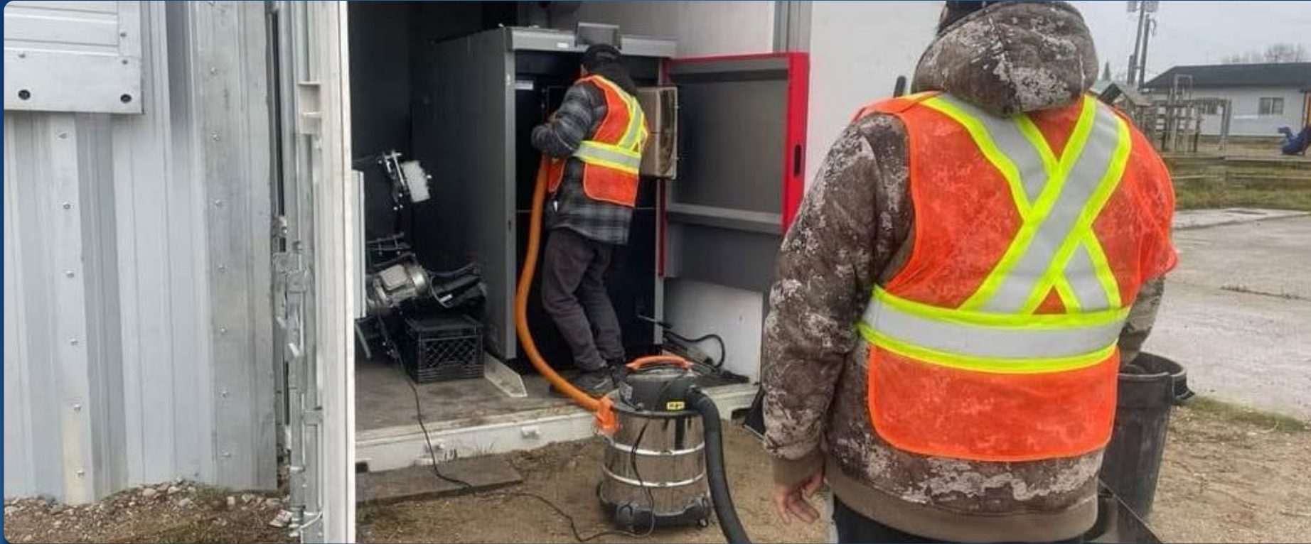
Cleaning boiler 2023