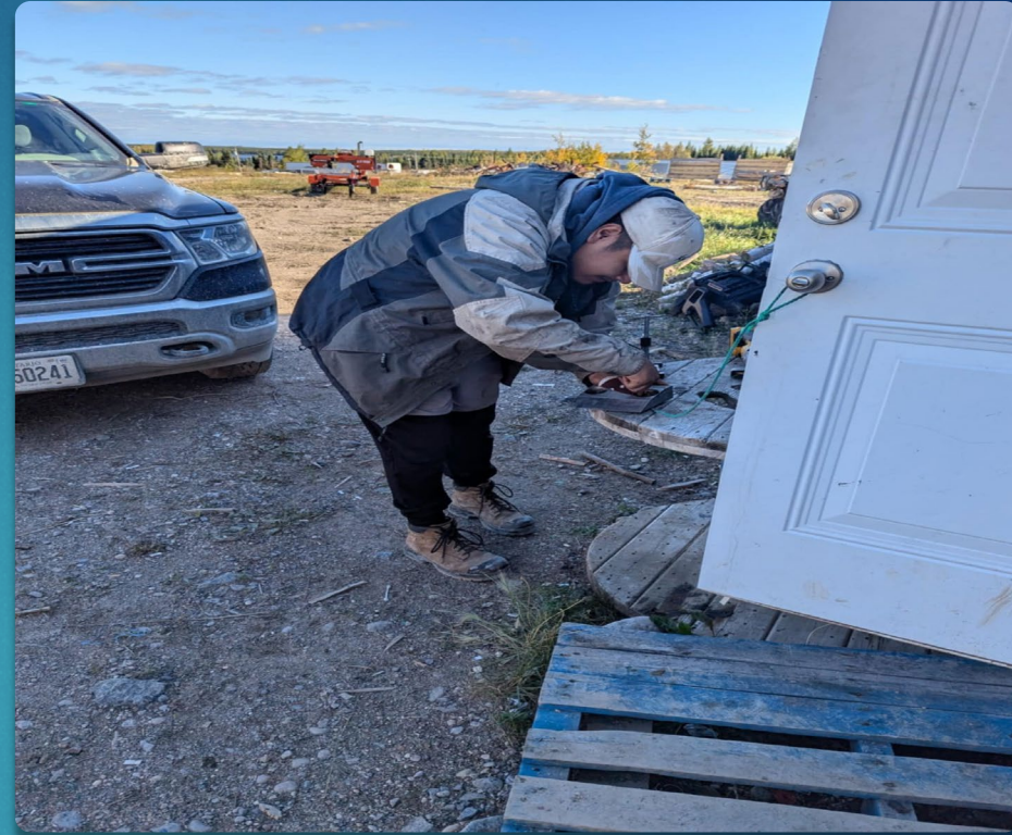
Chipper Blades and maintenance.